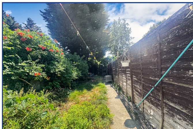
Sherwood Street, Reading, Berkshire. RG30.