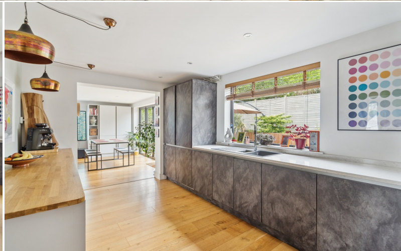
Fieldway Chalfont St Peter, Buckinghamshire, SL9 9SH