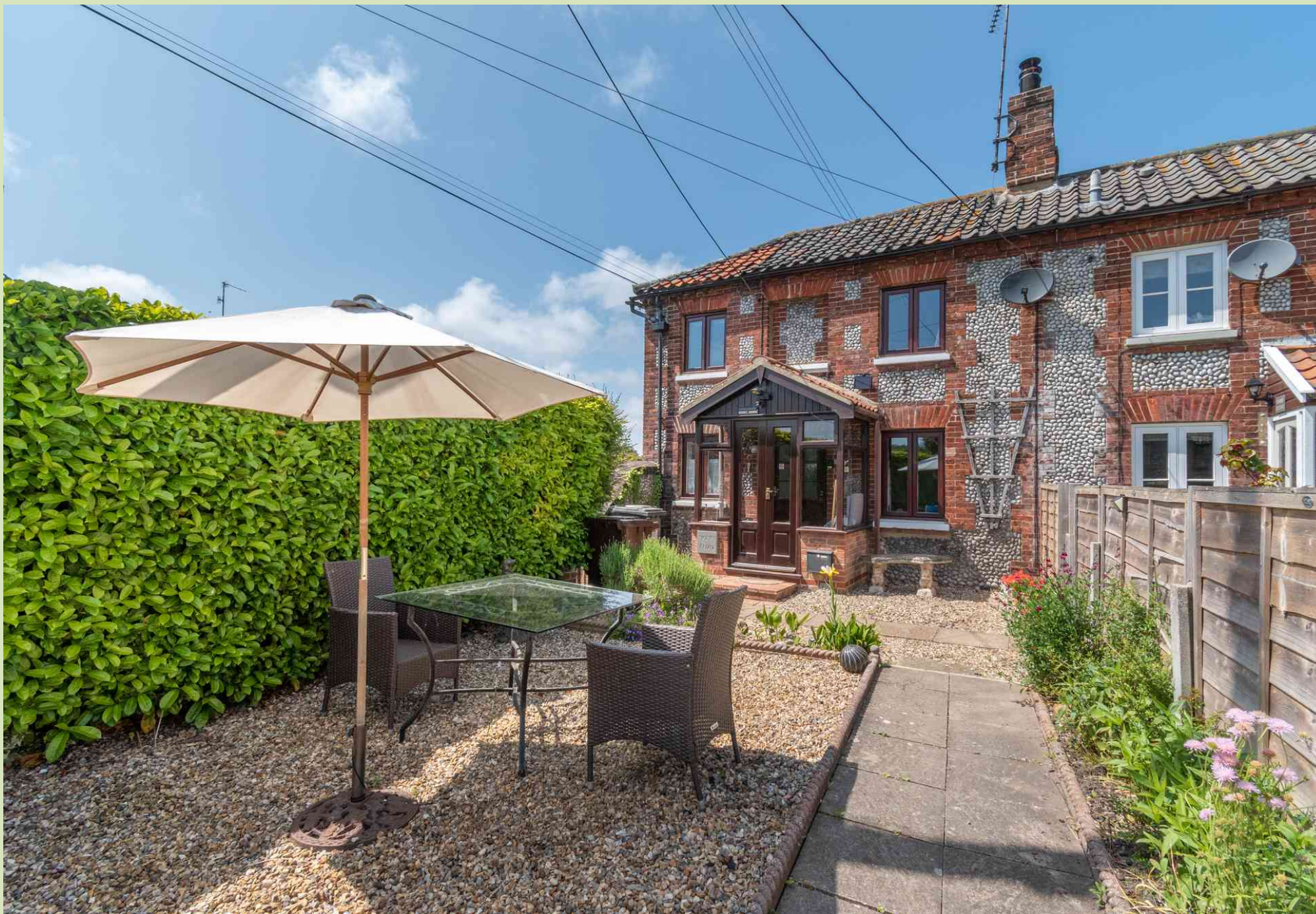
Mount Tabor, Stiffkey Guide Price £250,000