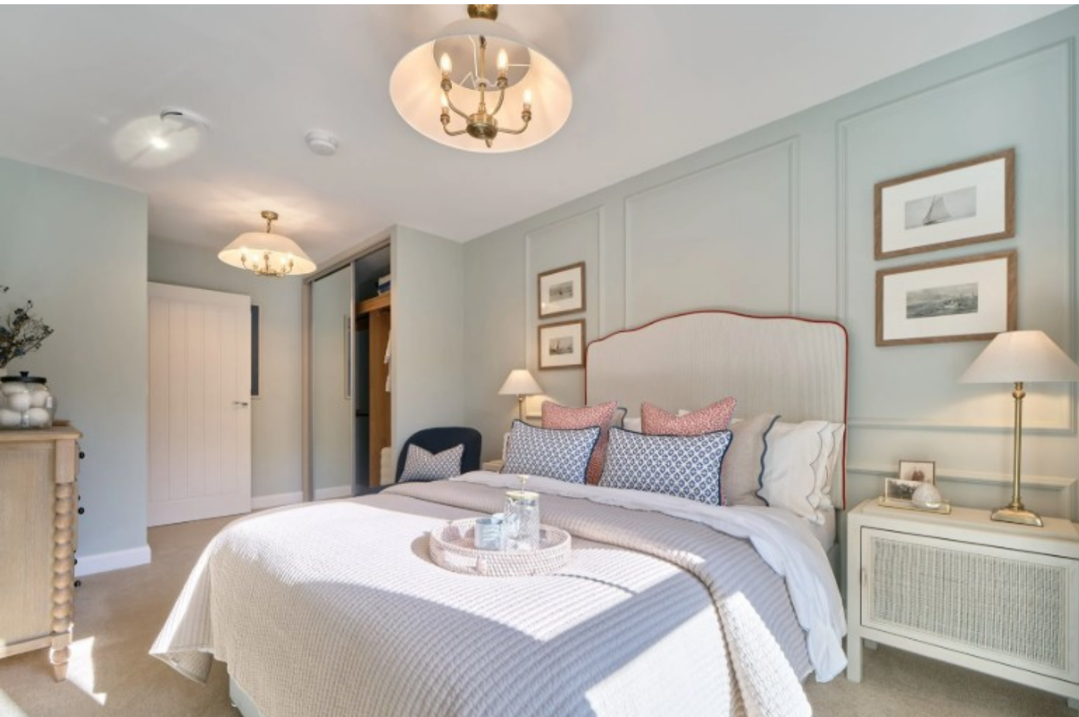
Barley Ridge Gardens