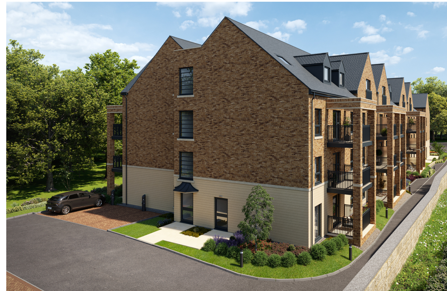
Barley Ridge Gardens, Priory Road, Stamford PE9 2ZP

For the latest apartment availability and prices, please ask your Sales Consultant or visit mccarthy-stone.co.uk/barley-ridge-gardens