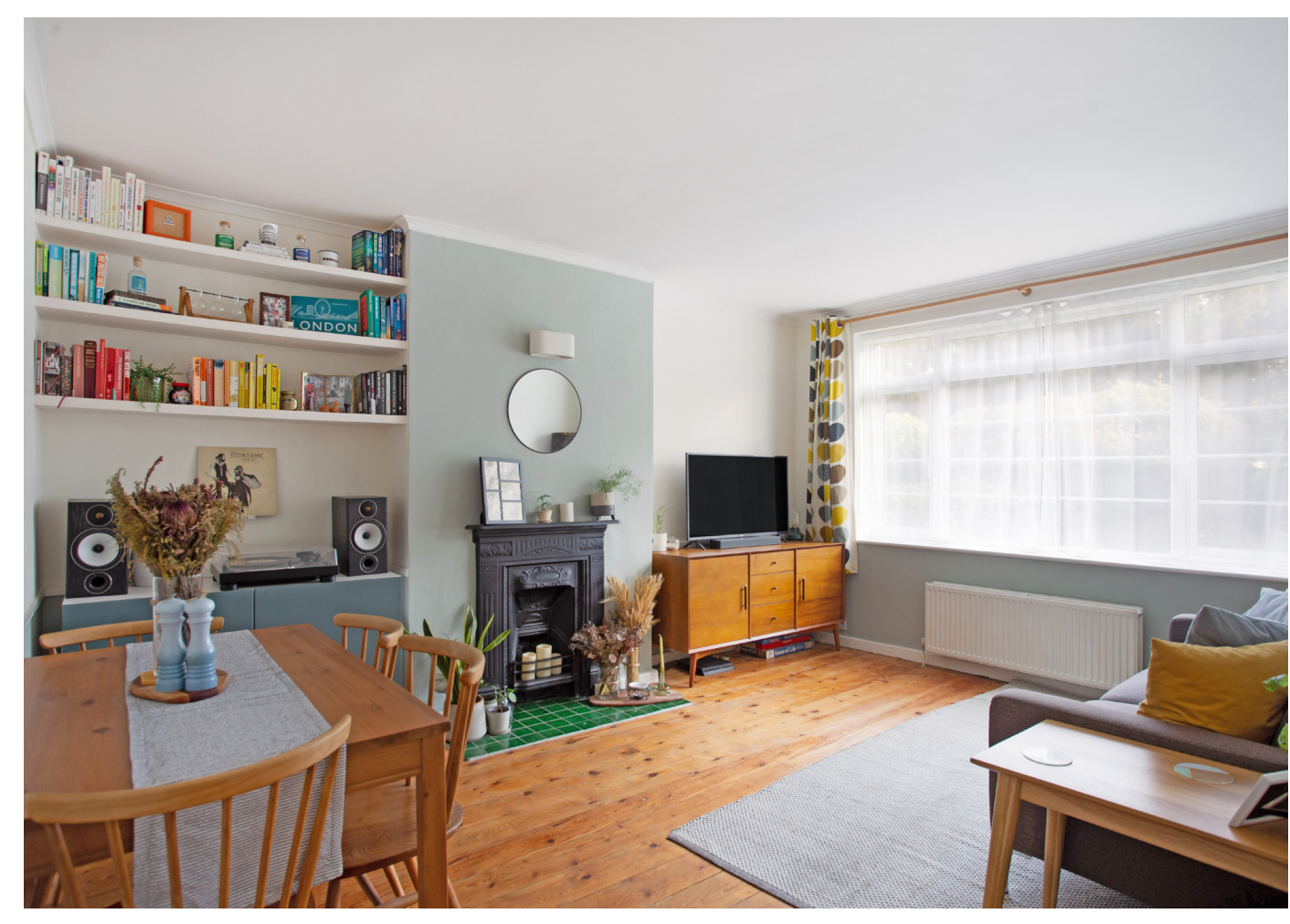
2 BEDROOM FLAT