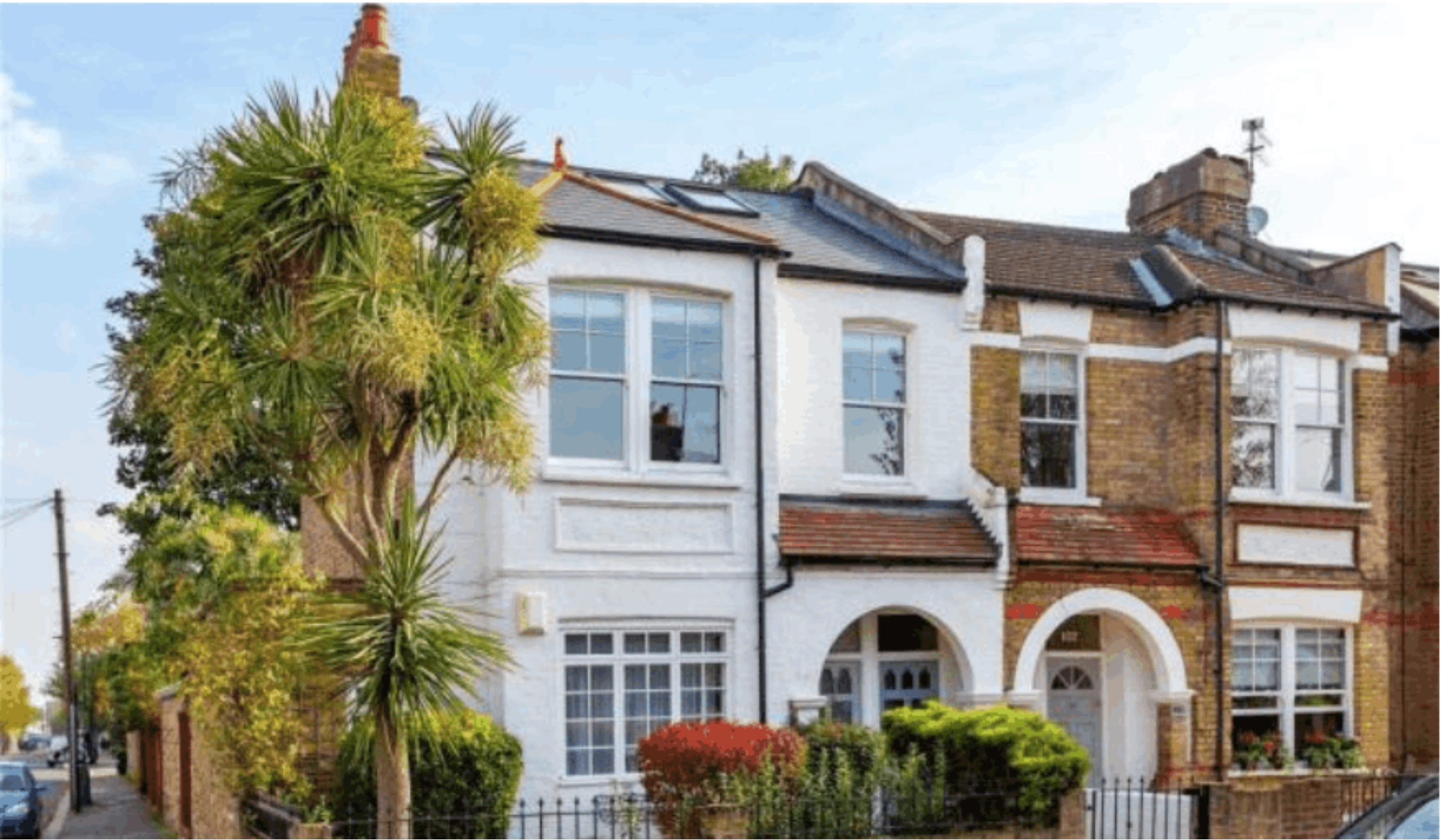
Aylmer Road, London, W12 9LQ