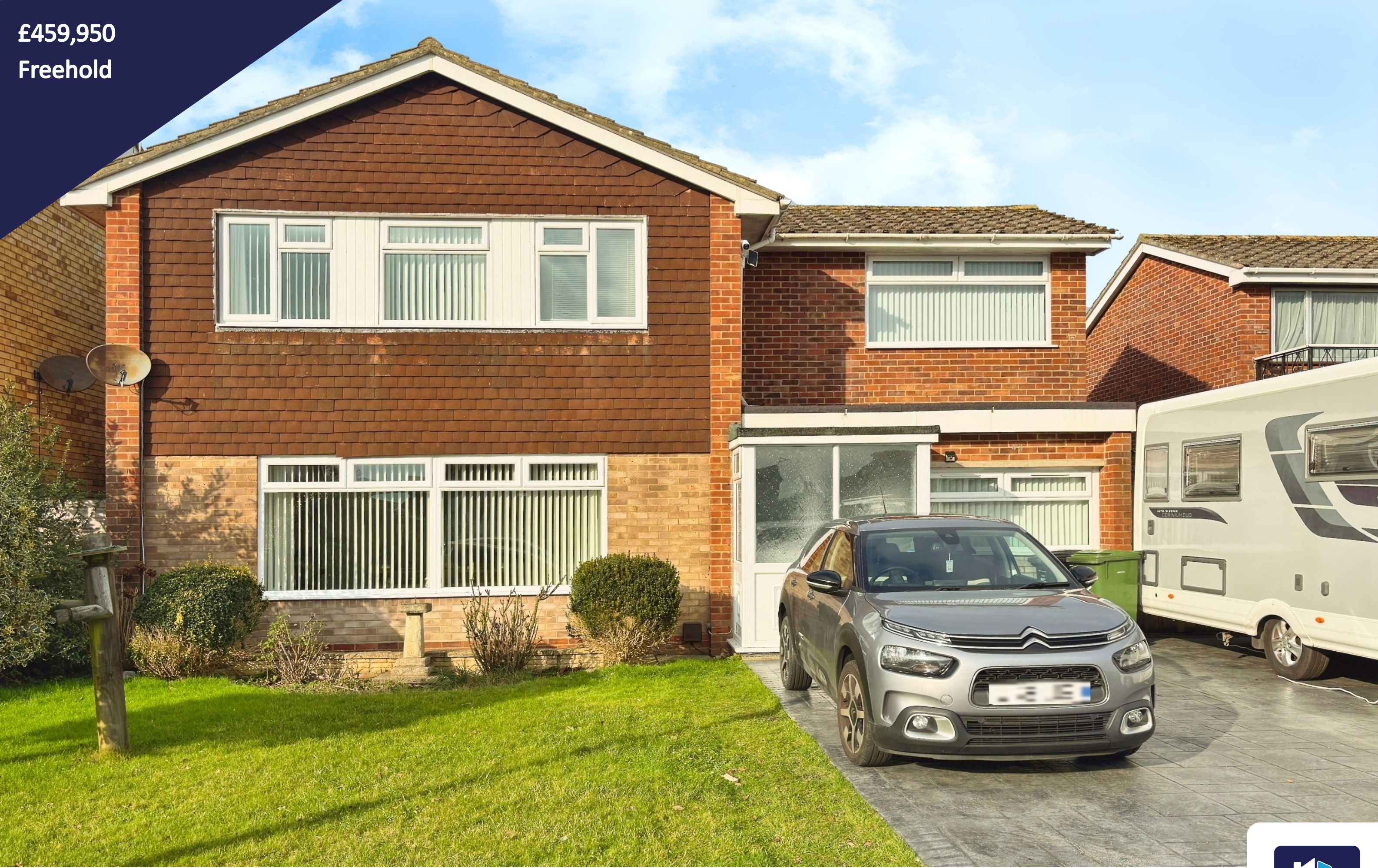
43 Rectory Drive, Burnham-on-Sea, Somerset TA8 2DU 4 Bedroom Detached House