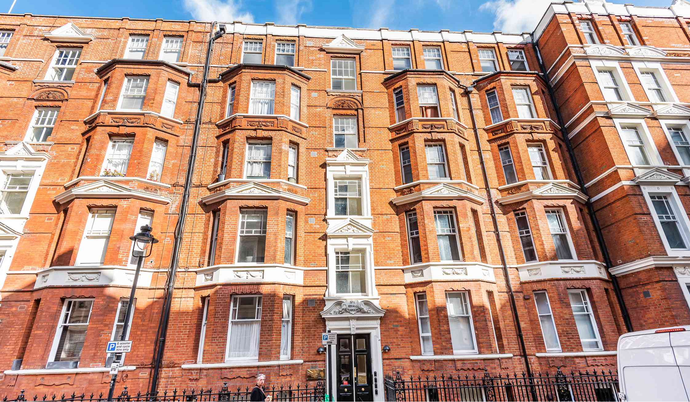
Bury Place, London, WC1A 2JS