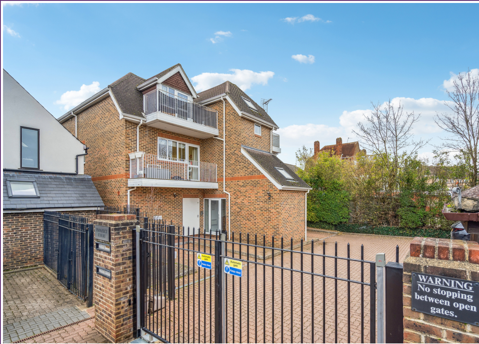
Flat 2 Prospect Court, Beaconsfield Road, Farnham Common, Buckinghamshire. SL2 3QJ £285,000 Leasehold