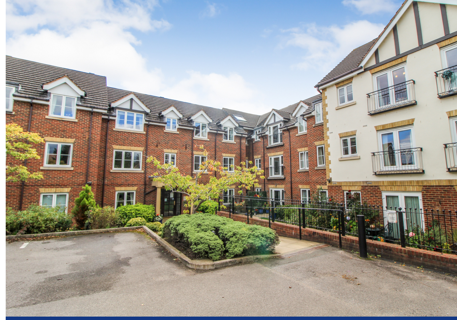
Calcot Priory, Bath Road, Calcot.