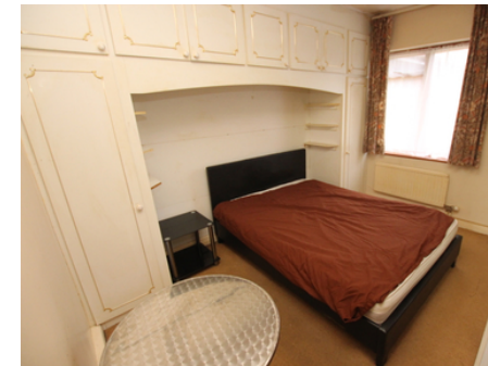
9 Rivermead Court, Ivel Close, Langford, Bedfordshire, SG18 9RW