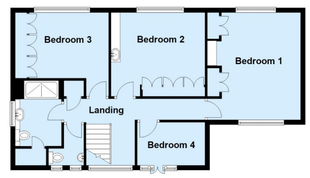
Total area: approx. 199.2 sq. metres (2143.7 sq. feet) This plan is for general layout guidance and may not be to scale. Plan produced using PlanUp.

Disclaimer: All Measurements are approximate. No equipment, circuits or fittings have been tested. These particulars are made without responsibility on the part of the Agents or Vendor their accuracy is not guaranteed nor do they form part of any contract and no warranty is given. Referral Fees: The businesses trading as Proctors recommend London and Country Mortgages (L&C) for fee free mortgage advice and MAP Limited Chartered Surveyors. It is your decision whether you choose to deal with them and, in making that decision, you should know that we receive referral fees from these companies. For Lettings we employ Rent4sure Limited Referencing Company and can receive rebates against their charges if tenants or landlords