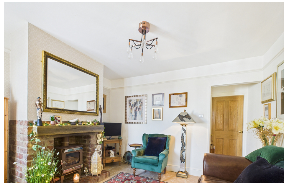
Belper Road, Bargate, Belper, Derbyshire DE56 0SU £290,000 -