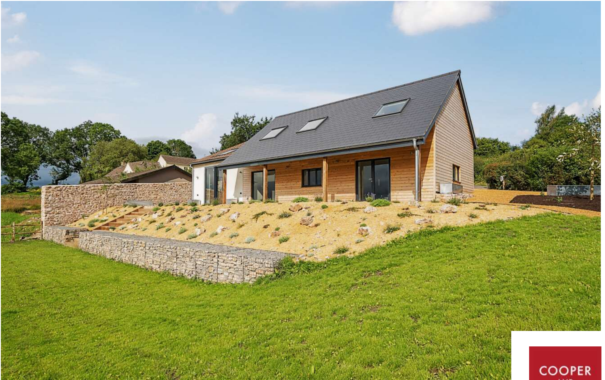
The Barn, Pitcot Lane, Stratton On The Fosse BA3 4SX