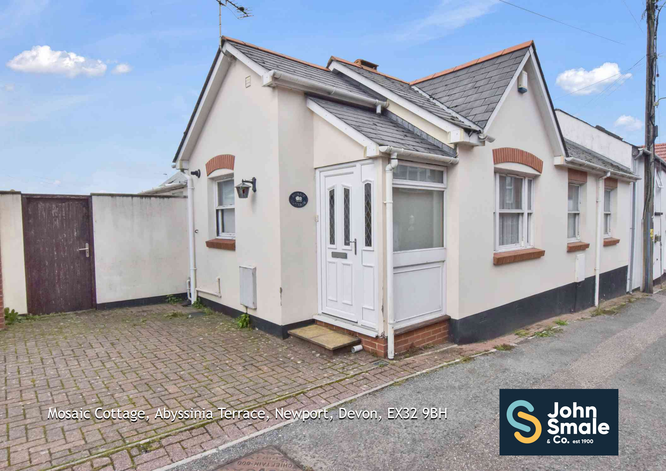
Mosaic Cottage, Abyssinia Terrace, Newport, Devon, EX32 9BH