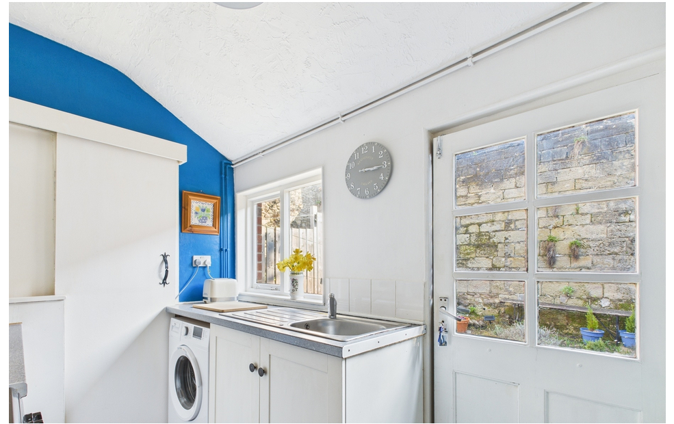
Penn Street, Belper, Derbyshire DE56 1GH £150,000 - Freehold