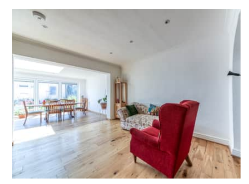
Manor Road, Mitcham, Surrey, CR4