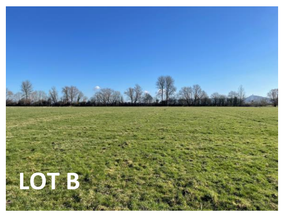
Auction Guide Price: OFFERED FOR SALE IN TWO LOTS

Wednesday 14<sup>th</sup> May 2025, 12 midday The Theatre, The Royal Bath and West Showground, Shepton Mallet, BA4 6QN Bid remotely via Livestream, in person or by proxy.