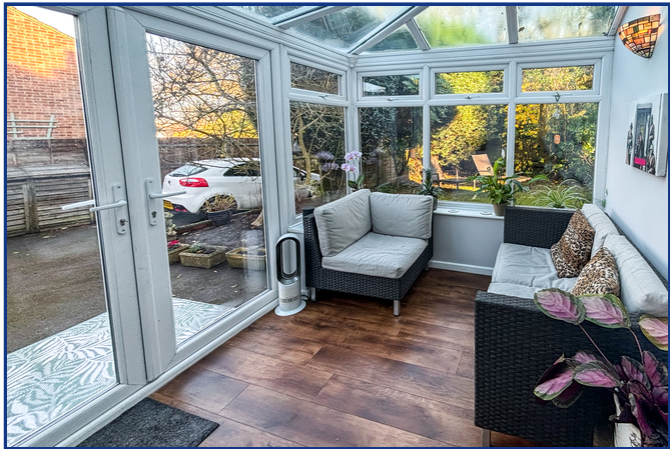
Honey End Lane, Reading, Berkshire.