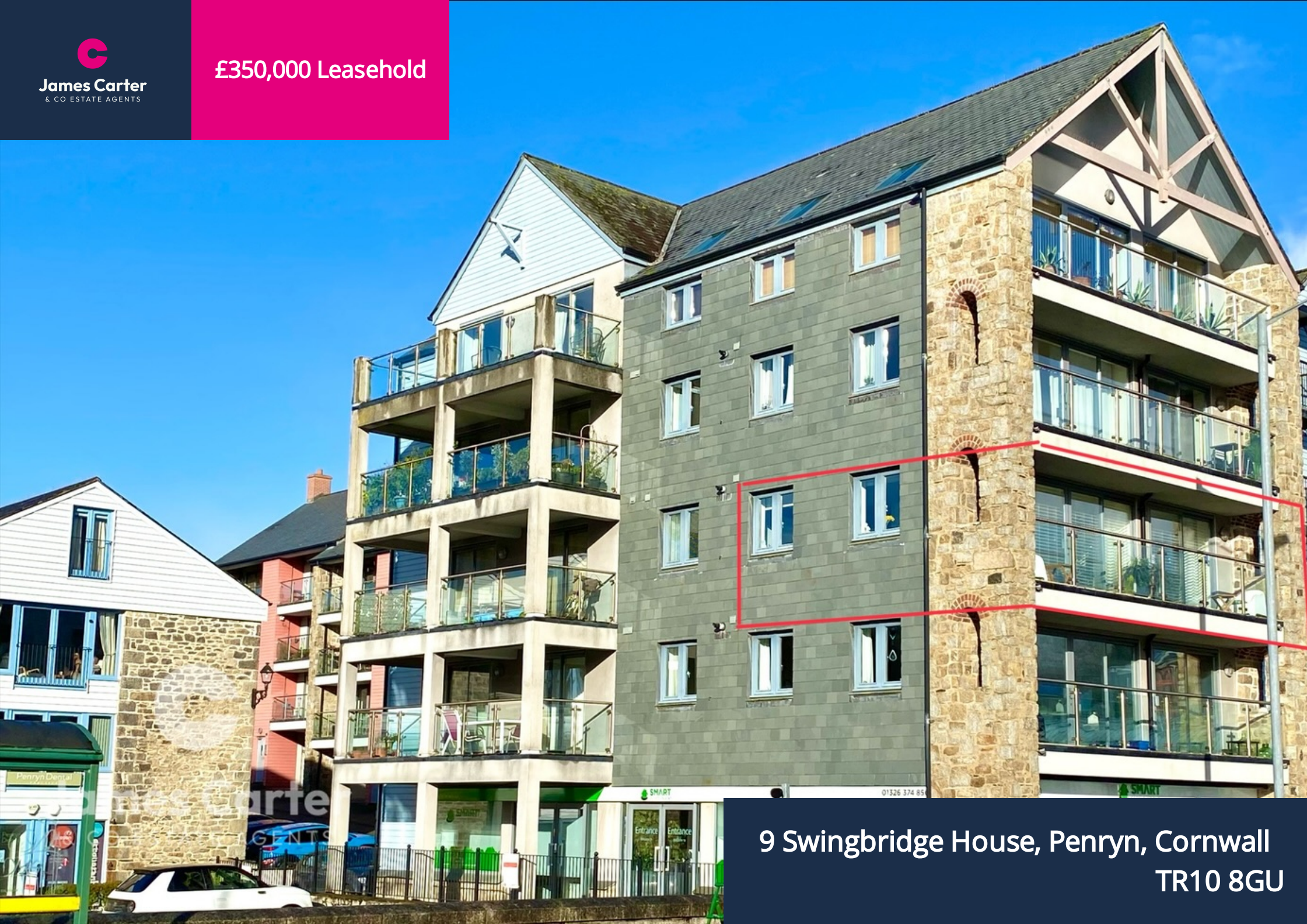
9 Swingbridge House, Penryn, Cornwall TR10 8GU