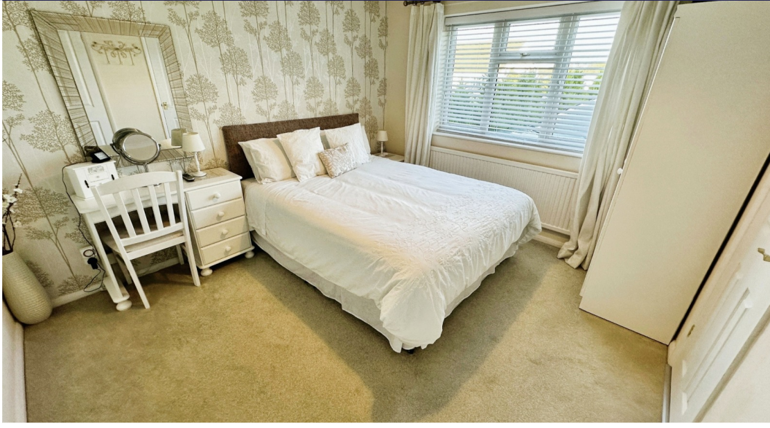
**Exceptional Property in Berrow: Modern Detached House with Bungalow Annexe**

Nestled in the heart of Berrow, we proudly present this remarkable property offering a unique blend of modernity, versatility, and panoramic views over the renowned Burnham & Berrow Golf Course.