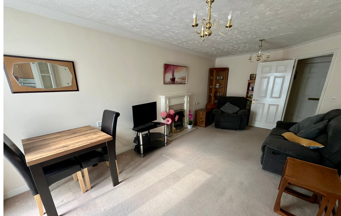
4 Perrin Court, Parkland Grove, Ashford, Surrey TW15 2GA £150,000 - Leasehold