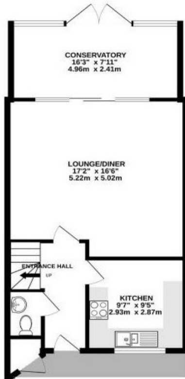
GROUND FLOOR 581 sq.ft. (53.9 sq.m.) approx.