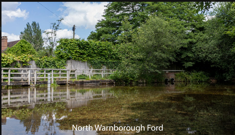
North Warnborough Ford