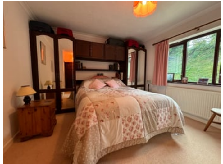
16' 3" x 11' 9" (4.95m x 3.58m) double bedroom suite with a range of fitted wardrobes, radiator, rear window to garden, multiple sockets.