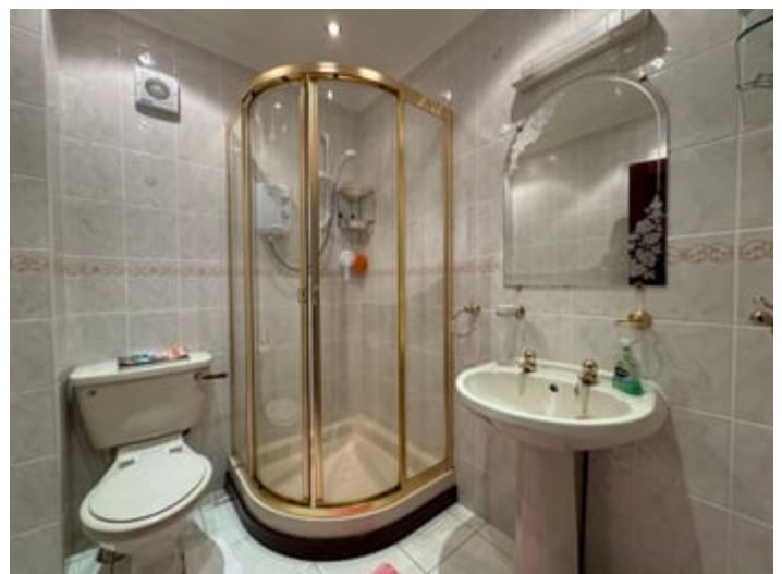
6' 6" x 5' 4" (1.98m x 1.63m) enclosed tiled shower, WC,