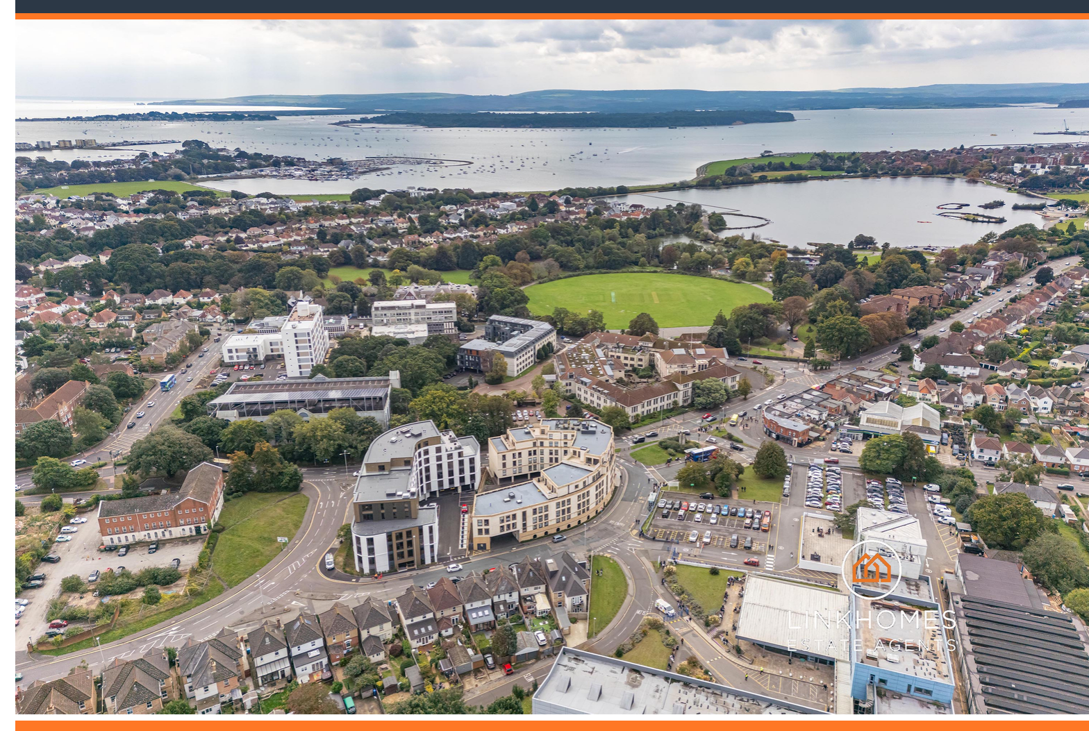
Flat 68, 1-3 The Cosmopolitan, Commercial Road, Poole, Dorset, BH14 0FD Guide Price £300,000

67 Richmond Road Lower Parkstone BH14 0BU sales@linkhomes.co.uk www.linkhomes.co.uk 01202 612626