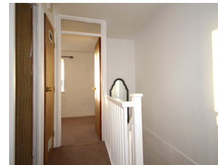
84b Swift Close, Letchworth Garden City, Hertfordshire, SG6 4LQ