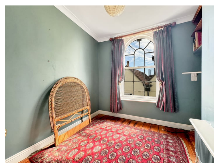
16' 3" x 11' 5" (4.95m x 3.48m) Sash windows, and arched windows to front and side, fireplace, space for double bed.