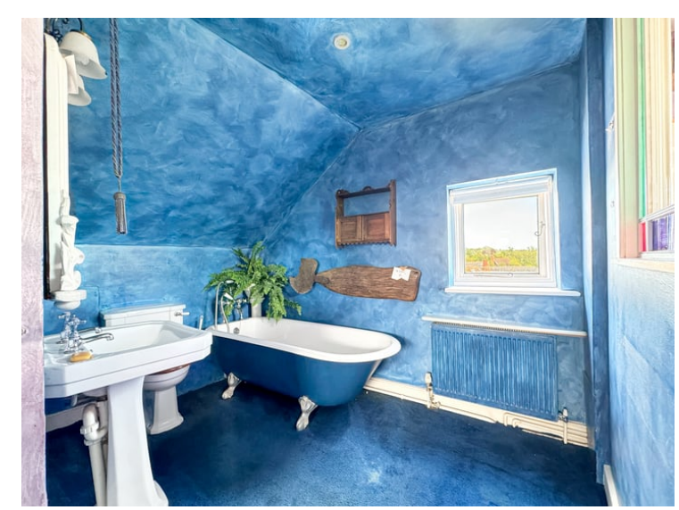
9'03" \times 9'06" (2.82m x 2.90m) Window to side, low level WC, free standing bath, wash hand basin.