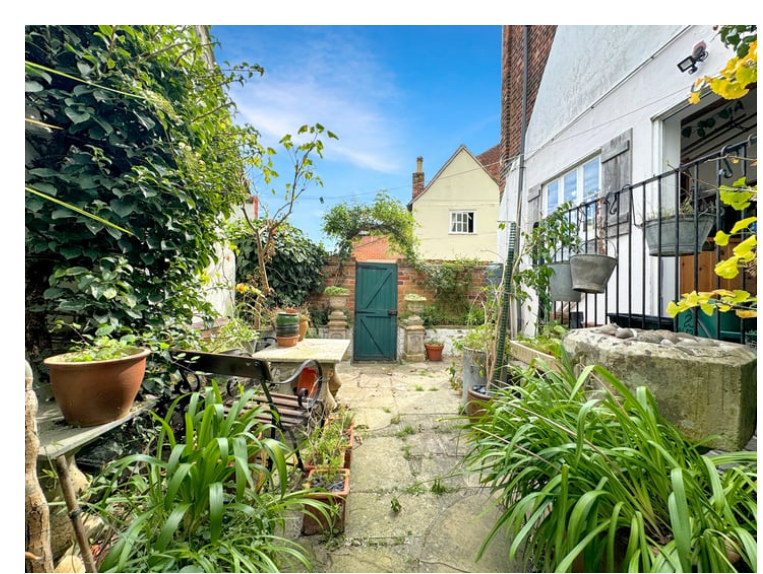
A courtyard private garden, retained by fencing and brick wall, with gated side access and storage.