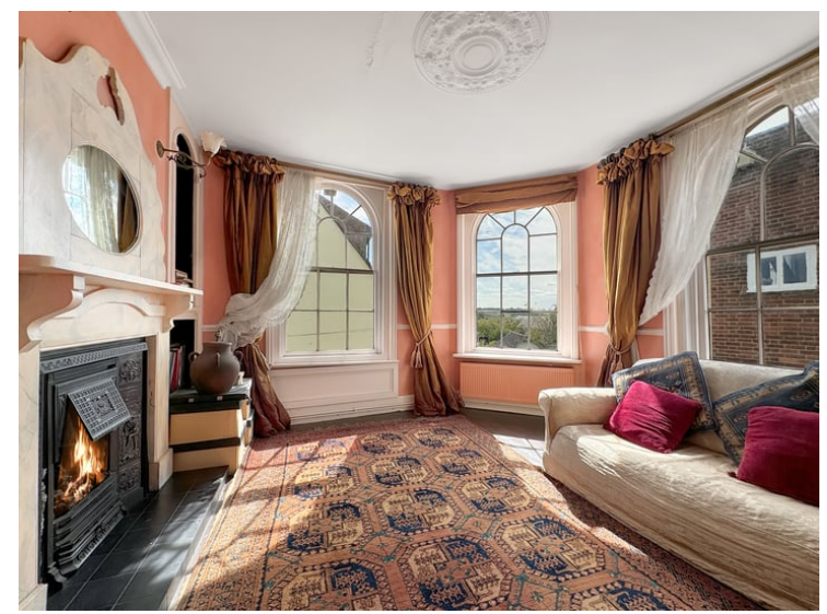
11'05" \times 10'07" (3.48m x 3.23m) Window to front, fireplace with wood surround and tiled hearth, alcove storage, door to.