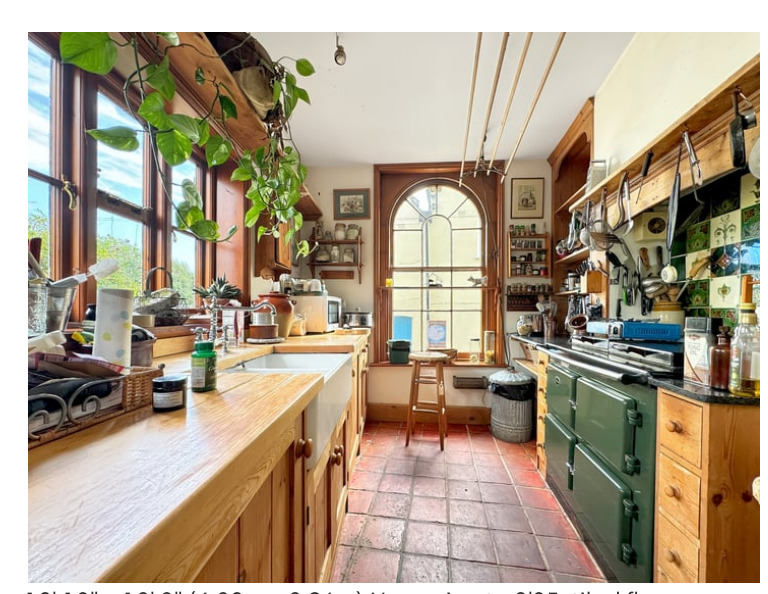
13' 10" x 13' 0" (4.22m x 3.96m) Narrowing to 8'05. tiled floor, windows to rear, arched window to side and stable wooden door opening onto the courtyard garden, fitted kitchen including a range of oak base units, solid oak worktops, space for range style cooker, inset butler ceramic sink