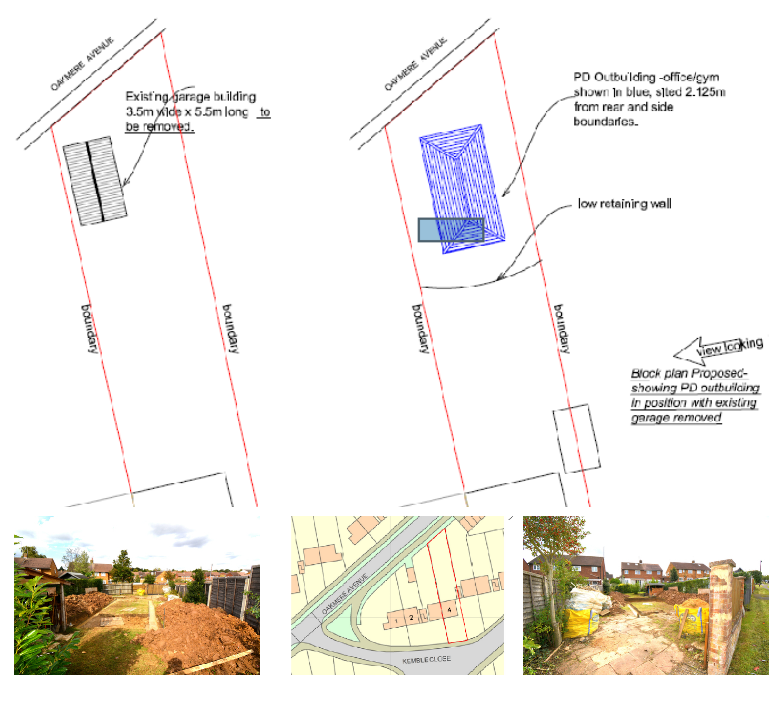
Kemble Close, Potters Bar, Hertfordshire, EN6 £150,000