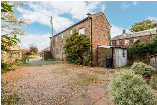
COURTYARD & PARKING

OUTSIDE Tarmacadam driveway to the front of the property leading to a stone chipped area providing parking with oil tank, wood store, shed and gated access to the side. To the rear of the property is a generous size lawned garden with sandstone patio, summer house, small orchard and vegetable plot. Recently re-roofed with integral solar panels.