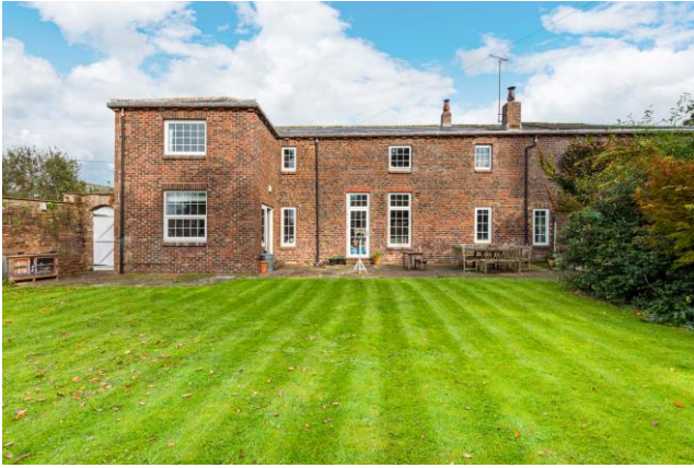
REAR OF THE PROPERTY