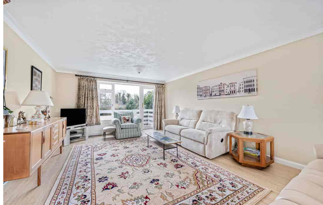
26 Bencombe Road, Marlow, Buckinghamshire SL7 3NZ Guide Price £795,000 - Freehold