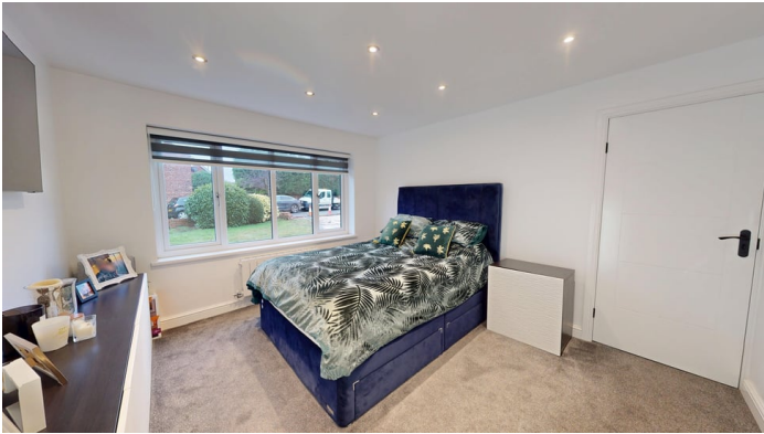
Master Bedroom with En Suite and Walk in Closet