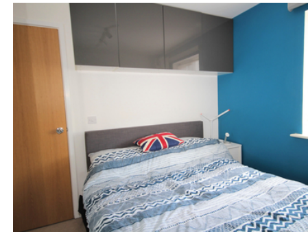
95 Wissen Drive, Letchworth Garden City, Hertfordshire, SG6 1FT