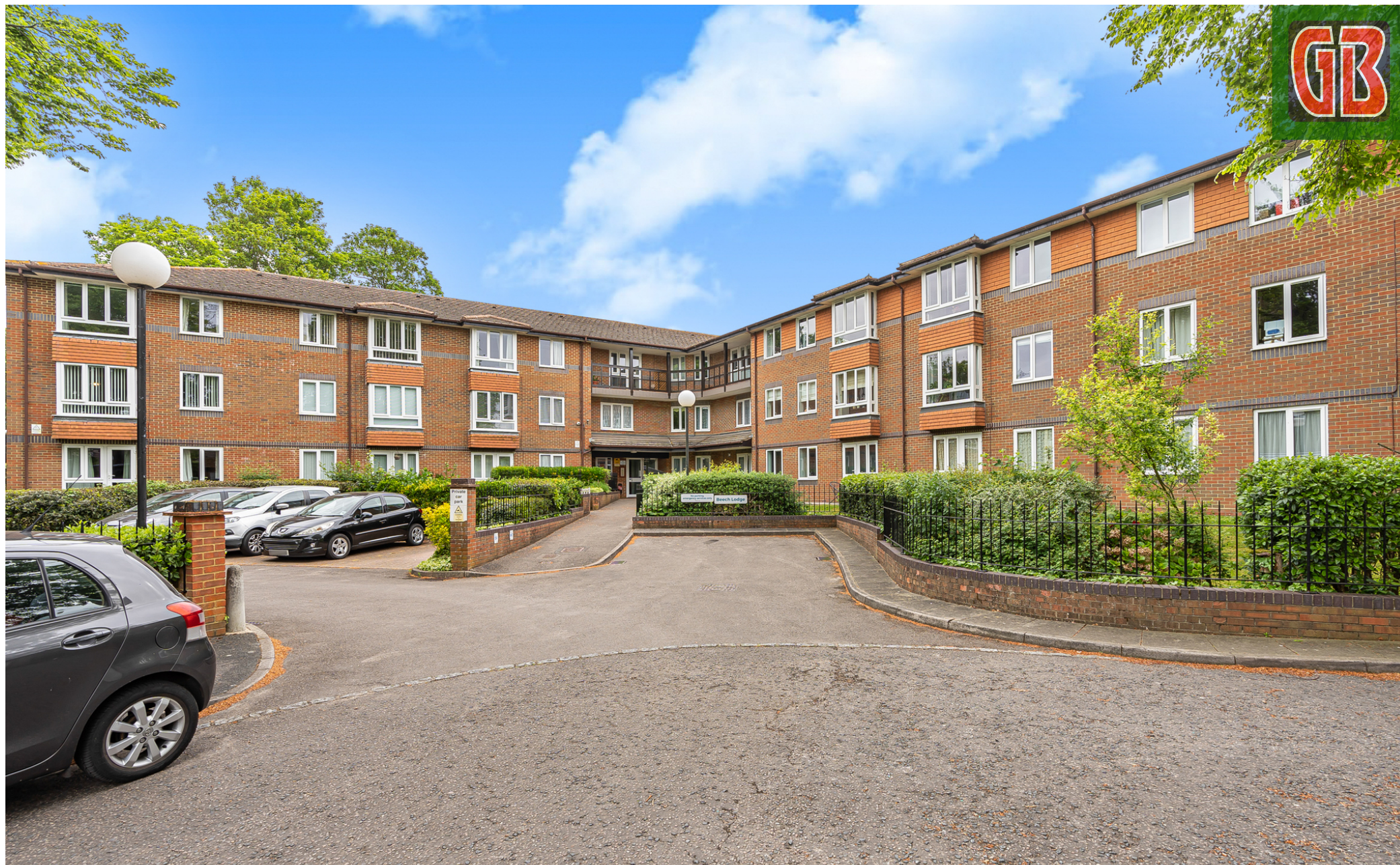
Flat 30 Beech Lodge, Farm Close, Staines-upon-Thames, Surrey. TW18 3EW. 1 Bedroom Retirement Property - £110,000 Leasehold