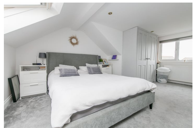
16'08" \times 11'05" (5.08m x 3.48m) Velux window to front and double glazed window to rear, space for bedroom furniture, fitted wardrobes and eaves storage.