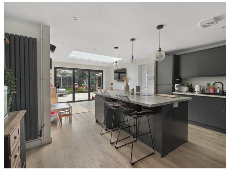
15' 1" x 9' 9" (4.60m x 2.97m)Inset lights, a modern fitted kitchen including island with breakfast bar, range of wall and base units, wall mounted oven and cooker, laminate worktop, inset sink with right hand drainer, induction hob, fridge/ freezer.