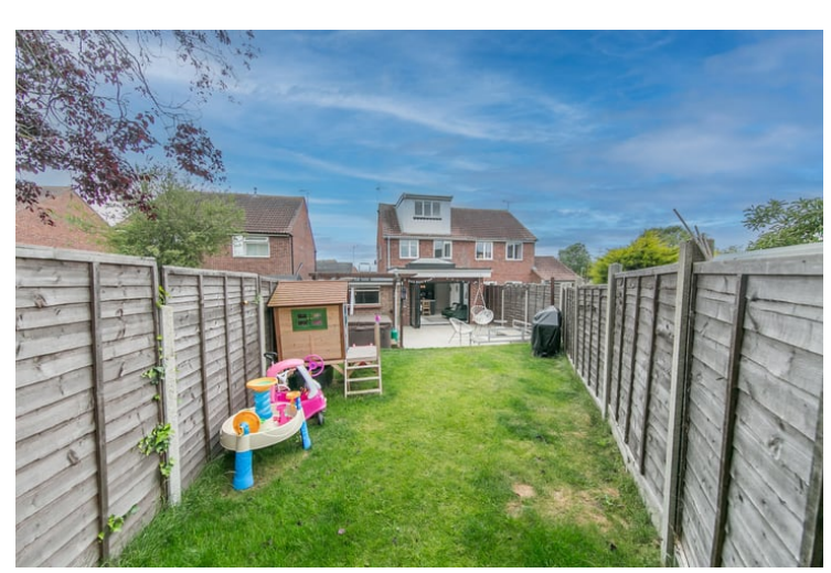
A well maintained rear garden with porcelain tile patio area, remainder laid to lawn, pergola, side door to garage, retained by privacy fencing.