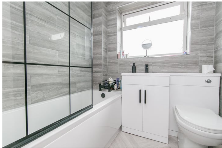
9' 10" x 6' 10" ( 3.00 \, \text{m} \times 2.08 \, \text{m} ) Double glazed frosted window to front, towel rail, wash hand basin, low level WC, panelled bath with over head shower, herringbone flooring.