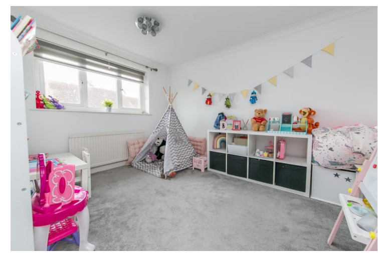
11'05" \times 8'09" (3.48m x 2.67m) Double glazed window to rear, radiator, space for double bed and furniture.