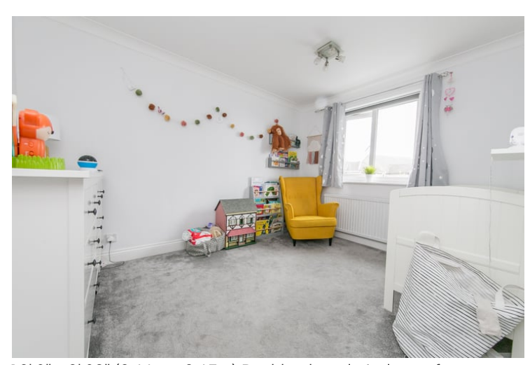
12'0" \times 8'09" (3.66m x 2.67m) Double glazed window to front, radiator, space for double bed and furniture.