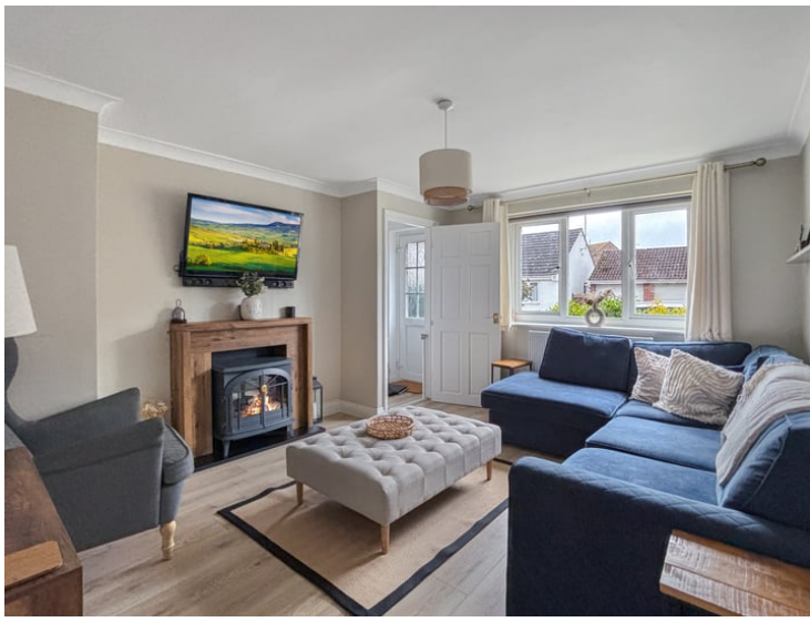
14'\ 2''\ x\ 11'\ 8''\ (4.32\ m\ x\ 3.56\ m) Double glazed window to front, paneled feature wall, electric fireplace with surround.