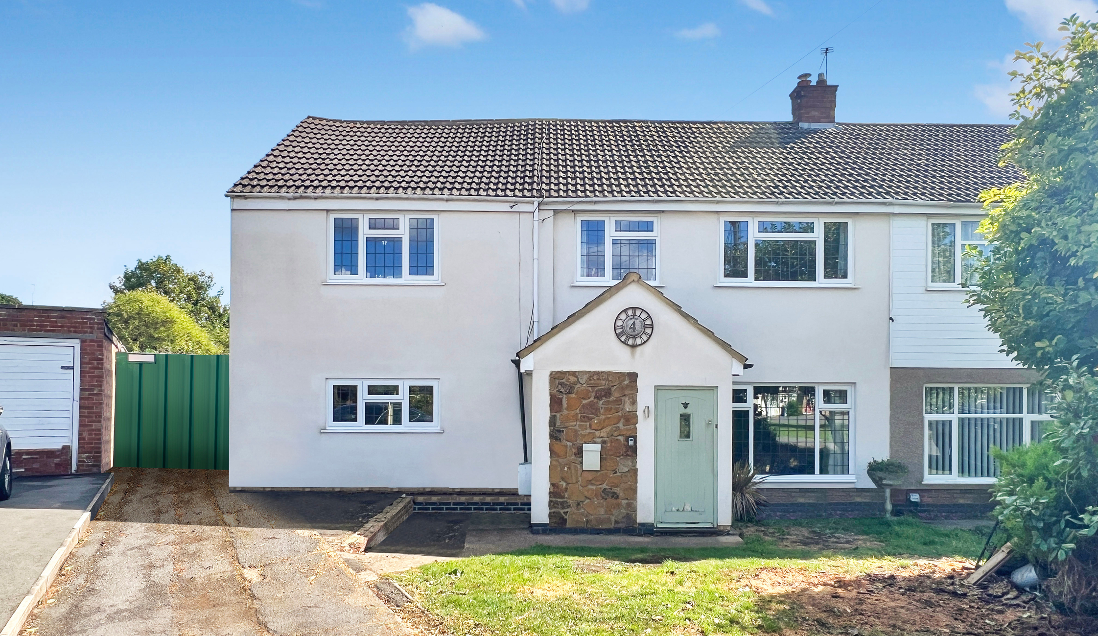
4 GRAFTON VIEW WOOTTON | NORTHAMPTON £460,000 FREEHOLD