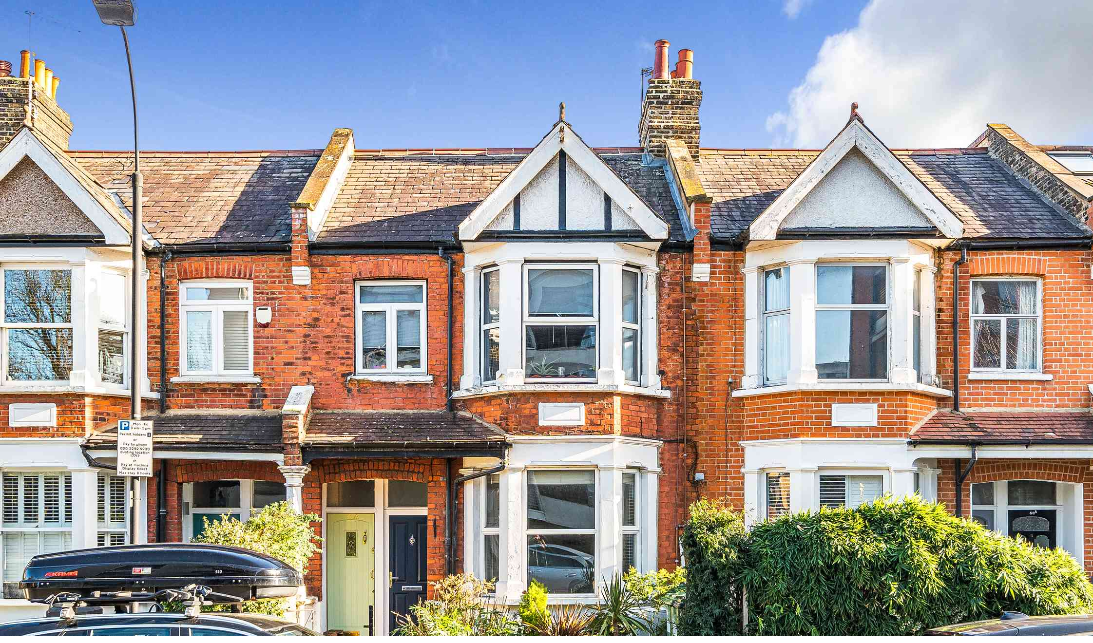
Larden Road, London, W3 7SX