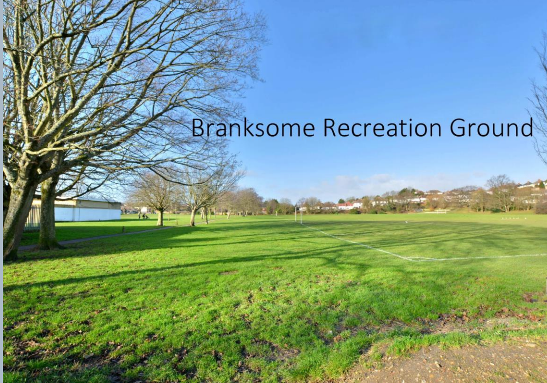
Branksome Recreation Ground