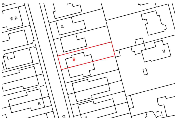
Polam House, 45 Chaucer Road Bedford, Bedfordshire MK40 2AL