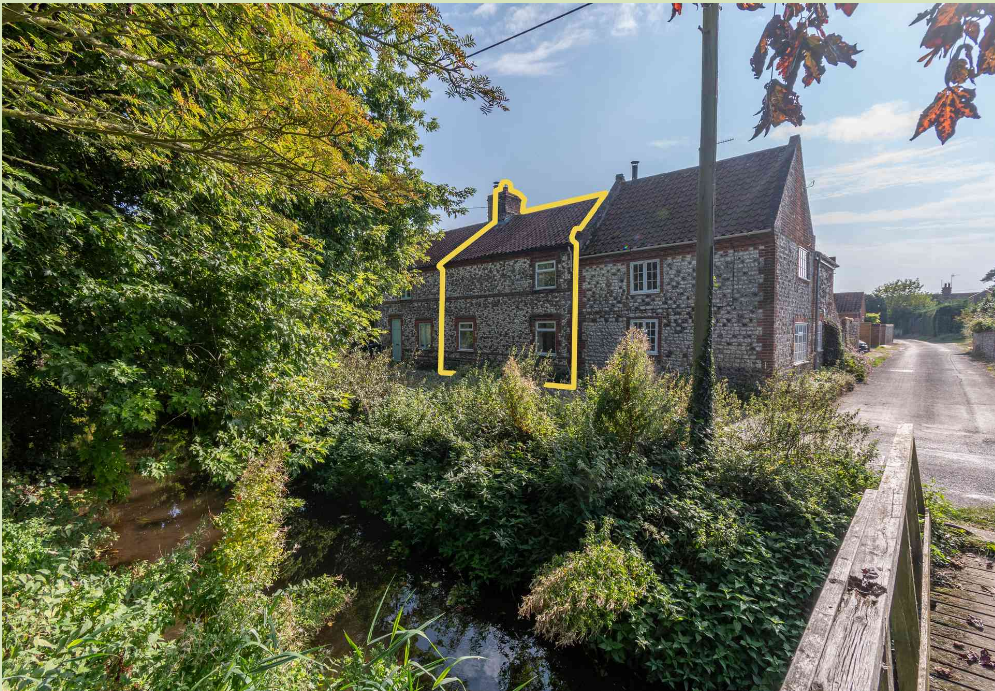
Roseleigh, Burnham Thorpe Offers in excess of £300,000