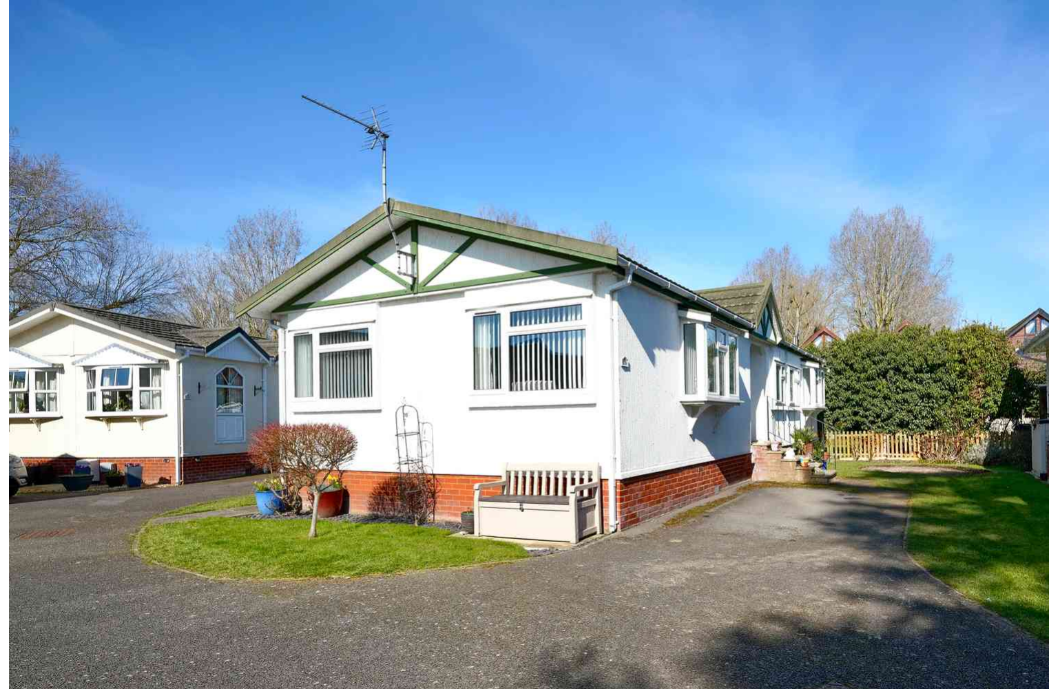
Mill Road, Buckden PE19 5QT