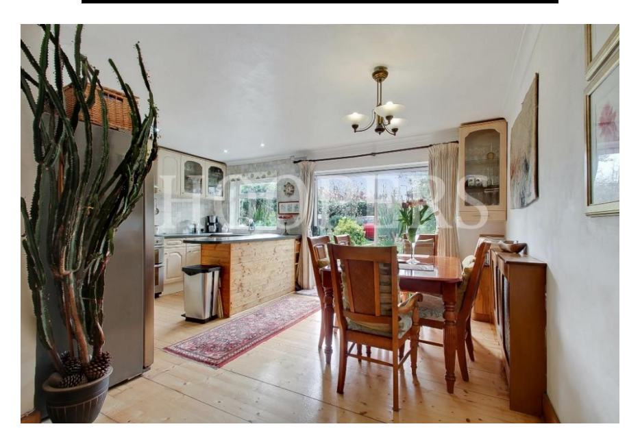
EPC Rating: D

We are delighted to bring to the market for sale this lovely extended corner house located at the junction of Alder Grove and Crest Road. The property has charming wrap around front, side and rear garden and a detached garage to the rear of the property approached via its own drive-in (accessed from Alder Grove). Benefits include:-