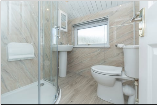
1.75m x 1.7m (5' 9" x 5' 7")