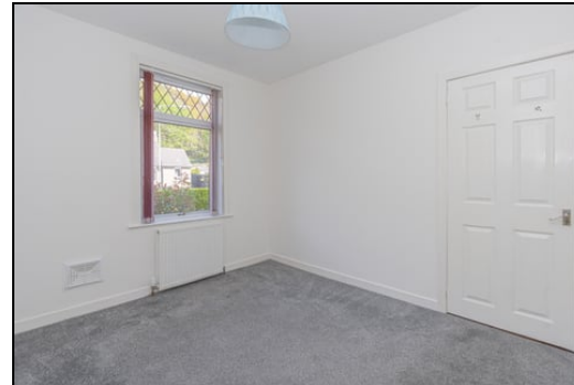
3.28m x 3.08m (10' 9" x 10' 1")