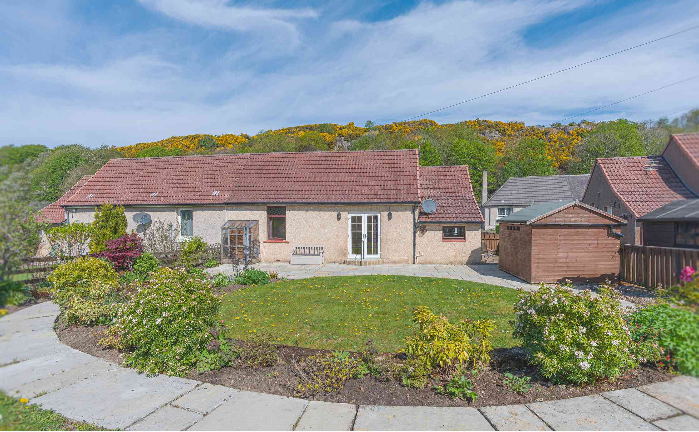
Offers Over £134,500 43 Balgreggie Park, Cardenden, Lochgelly, Fife, KY5 0NQ