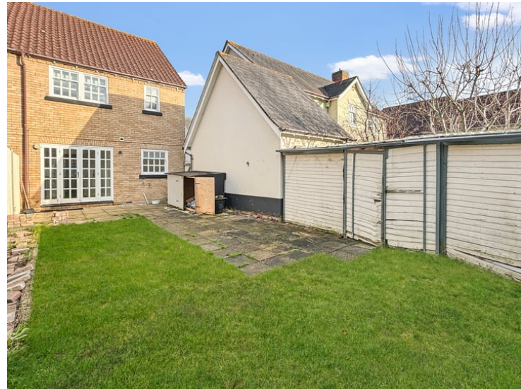
Mainly laid to lawn with patio area, gated side access.