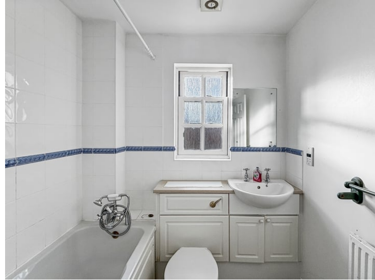
Obscure window, panel bath, vanity WC and wash hand basin, tiled walls and radiator.