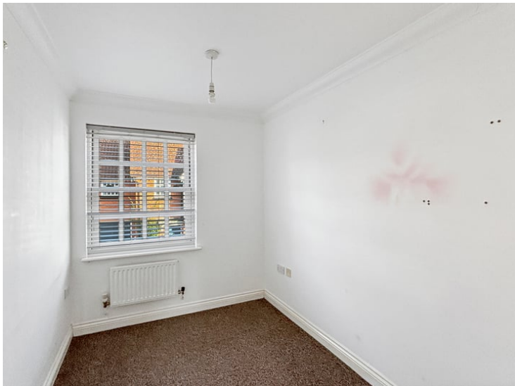
9' 7" x 6' 9" (2.92m x 2.06m) Window to front and radiator.