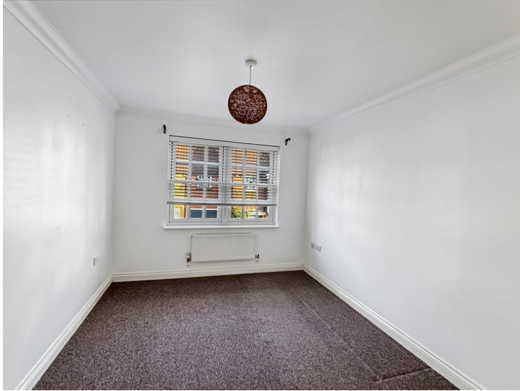
9' 10" x 9' 0" (3.00m x 2.74m) Window to rear and radiator.