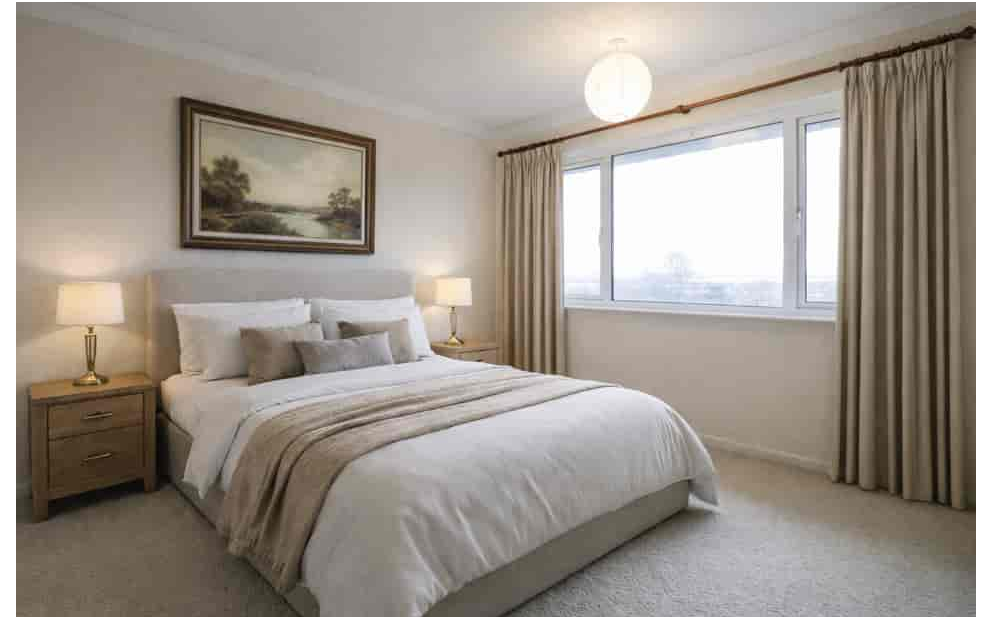
Ilex Close, Hardingstone, Northampton NN4 6DS Offers Over £150,000 - Leasehold