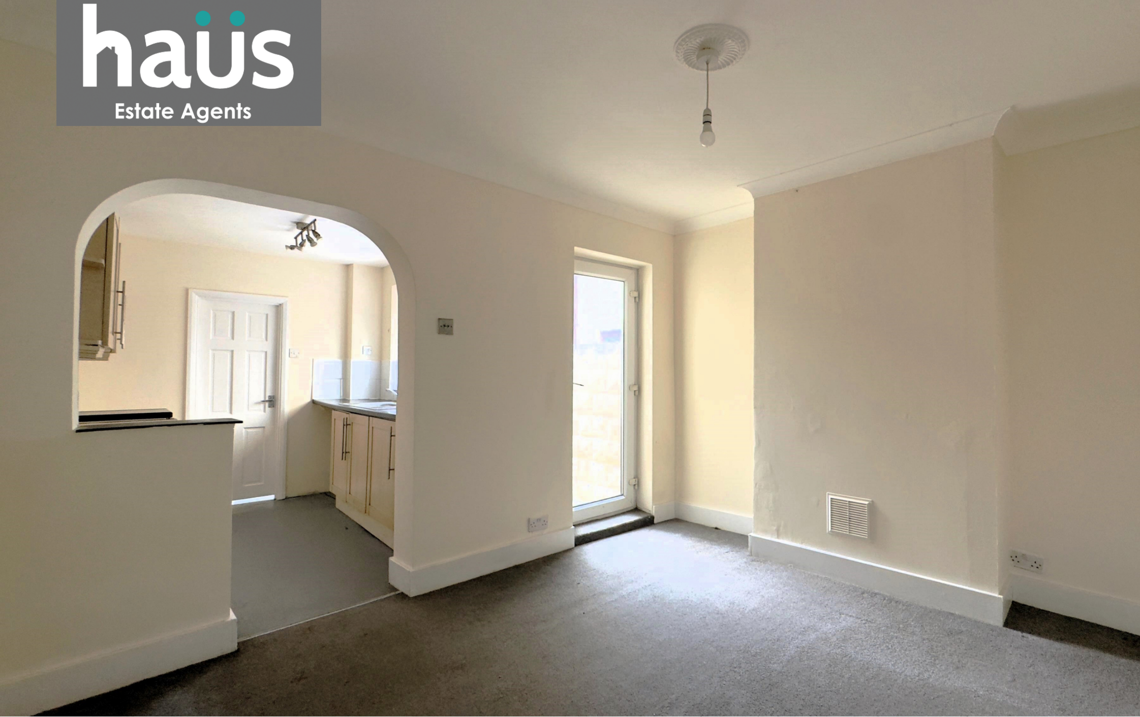
Three Bedroom Terraced House Milton Road, Gillingham, Kent, ME7 5LP