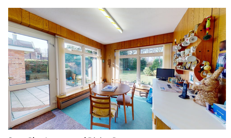
Open Plan Lounge and Dining Room