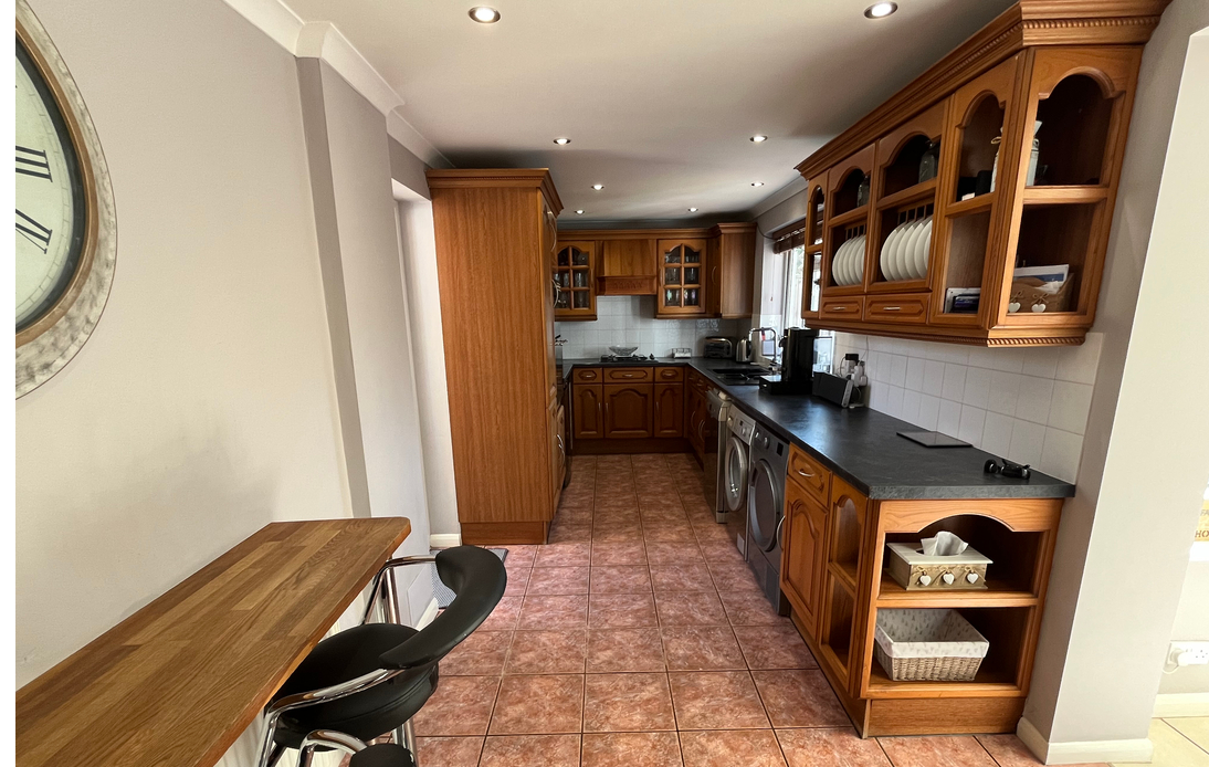
20 Courtfield Road, Ashford, Surrey TW15 1JR £525,000 - Freehold