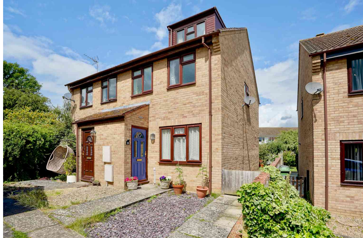
Manor Close, Buckden PE19 5XR