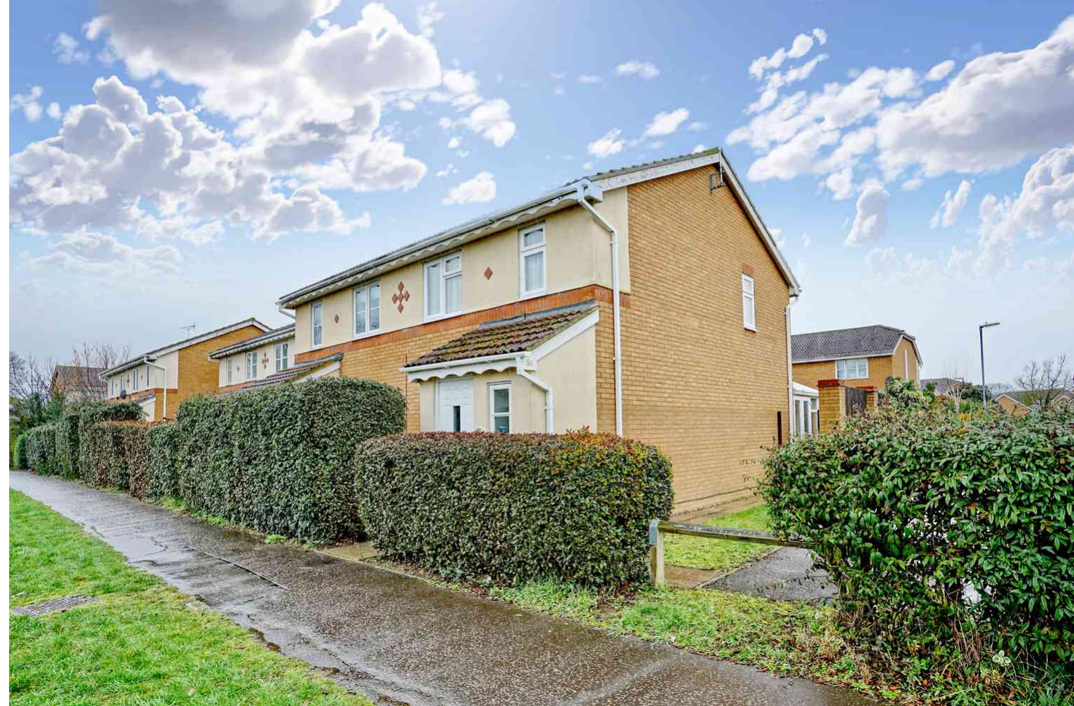
56 Alder Drive, Huntingdon PE29 7WJ