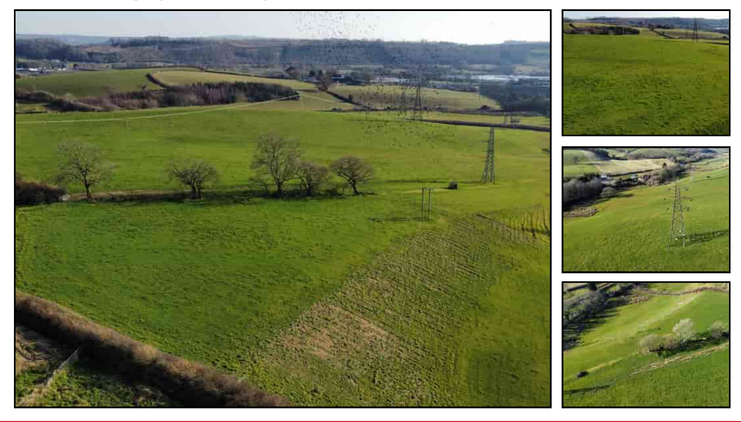
24 Acre Block of Agricultural Grazing Land. Natural Water Supply with Stream. Mostly Level & Gently sloping South Facing with Double Gate Entrance off a Quiet Country Road.

24 Acres of Land at, Llysonnen Road, Carmarthen, Carmarthenshire. SA31 3RP. £240,000 A/5421/NT